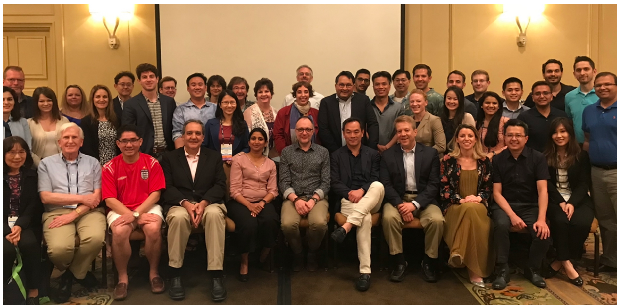
2018 FOIS ARVO Meeting in Hawaii